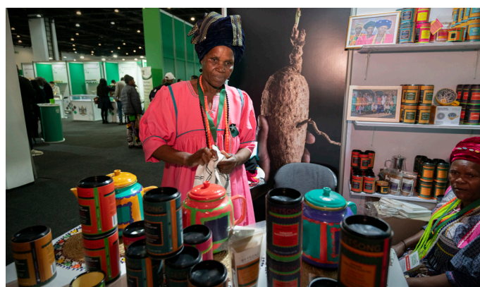
Thirty small businesses were supported to attend the African Biotrade Festival to display their ingredients and products and meet new potential customers and consumers

Held in Johannesburg from 14 to 16 September 2023, in partnership with the 2nd Organic & Natural Products Expo Africa (O&N), the festival attracted more than 4,000 visitors including 550 dedicated registrations for the ABF.