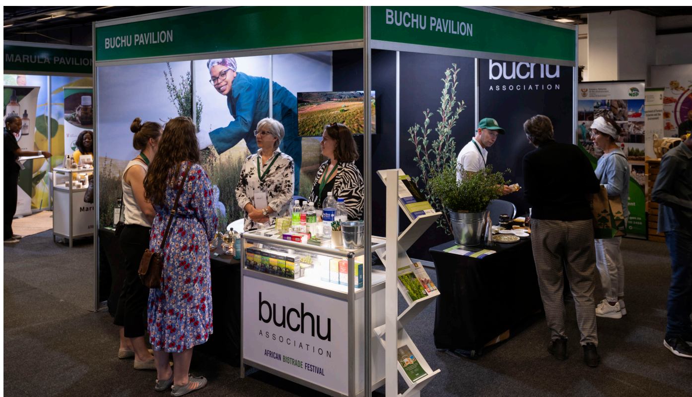
The Buchu sector pavilion was popular with African Biotrade Festival visitors interested in learning about a high-value indigenous plant species

The ABF featured six pavilions dedicated to high-potential biotrade species and their sector organisations, and one specialist pavilion to showcase biotrade research, testing and standards. The species on show included Baobab, Marula, Buchu, Sceletium, Honeybush and various indigenous species used for essential and vegetable oils.