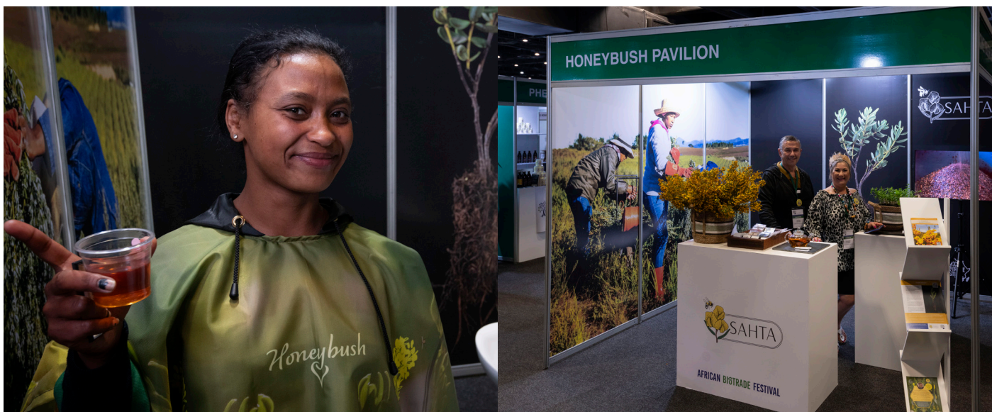
The Honeybush community was well represented at the festival, with a dedicated pavilion and a number of small business stands

Also at the festival was a popular tasting experience featuring indigenous Honeybush and Rooibos teas. Biotrade producers and manufacturers have traditionally had to travel at great expense to international trade shows to showcase their products; but the African Biotrade Festival has now established itself as a powerful domestic event which contributes to an economically sustainable and equitable biotrade sector.