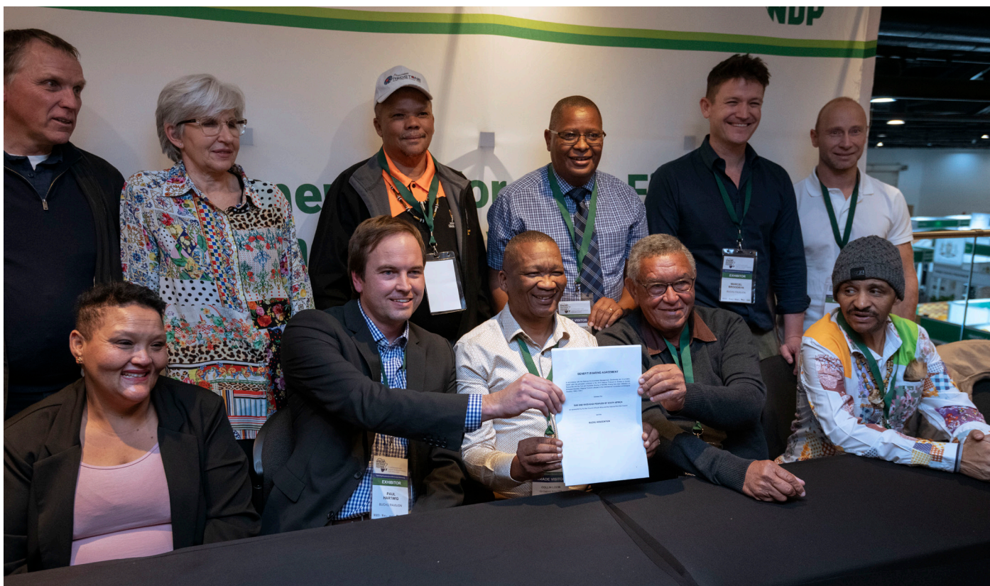
A landmark agreement was signed between the SA government, Buchu Association, the National Khoi Council and South African San Council

Among many highlights at the event was the historic signing of an Access and Benefit-Sharing (ABS) agreement between the Buchu Association, the SA government represented by DFFE, the National Khoi Council and the South African San Council.