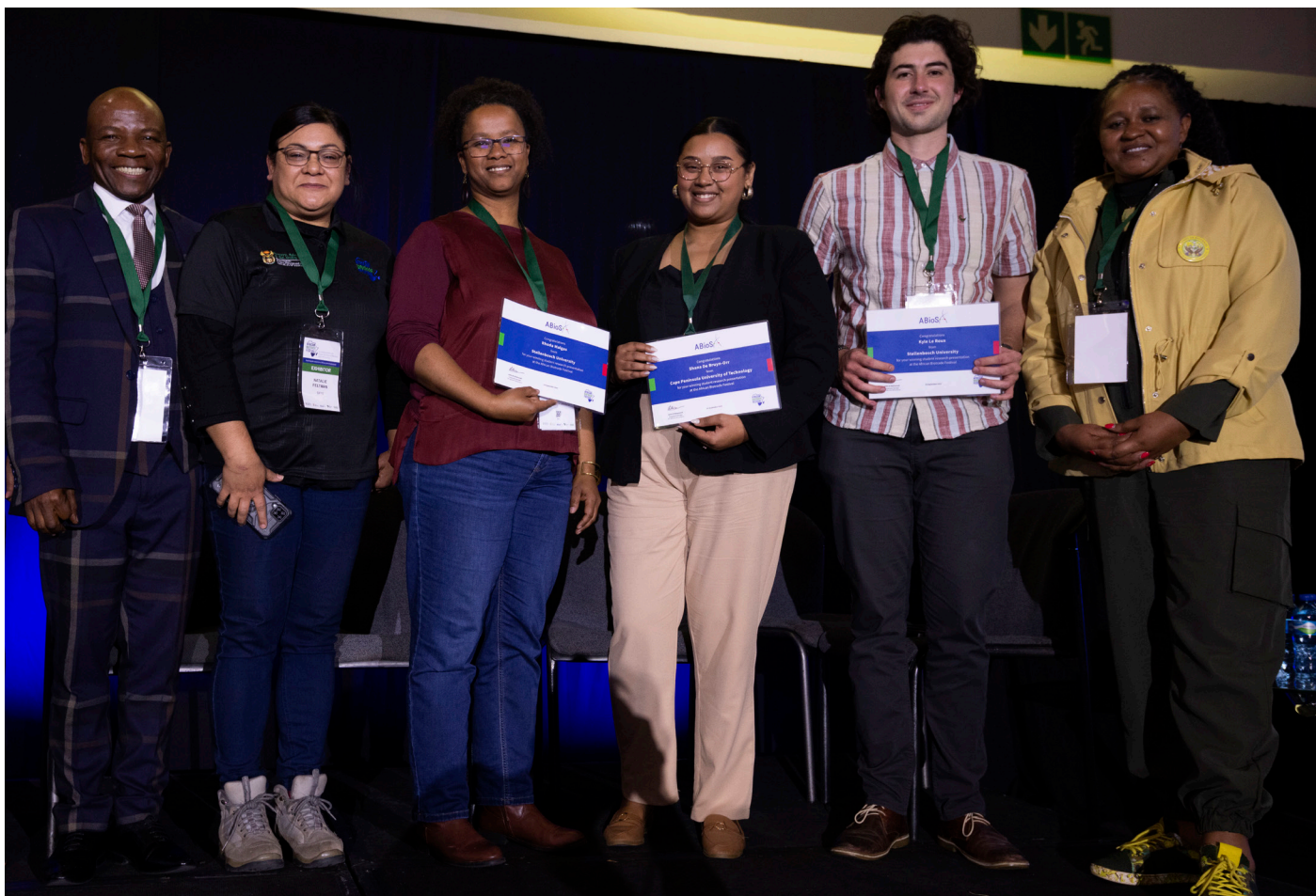
Six students made excellent presentations about relevant and high-impact research, with three selected to attend an international conference of their choice

Six students were given the opportunity to present their research, which included health and medical benefits of biotrade species, modelling of efficient oil extraction, environmental sustainability and community cultivation methods.